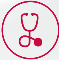
Medical Devices & Healthcare