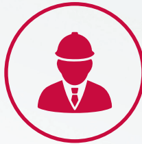
Building Services & GreenTech