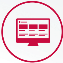
Software & ICT